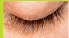
Day 42 – 72.29%

Independent Clinical Studies of SymPeptide ® XLash, a key ingredient in LashesMD ® . SymPeptide ® is manufactured by Symrise, Inc. Used with permission.