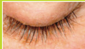
Day 28 – 66.39%